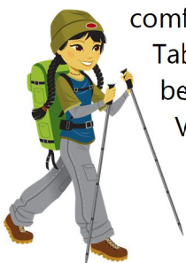
Table Rocks Area has some of the most beautiful scenic panoramas of the Rogue Valley, vistas of the volcanic Cascades and Siskiyou Mountain ranges. Come enjoy God's amazing creation along with some wonderful young adults.

This week on Formed.org – Finding Happiness in Marriage. https://watch.formed.org/beloved-finding-happiness-in-marriage To access your parish subscription, visit FORMED.org. Click "sign-up." Select "Sign up as a parishioner." Find "Our Lady of the Mountain" by name or by ZIP (97520). Enter your email and you should be in."